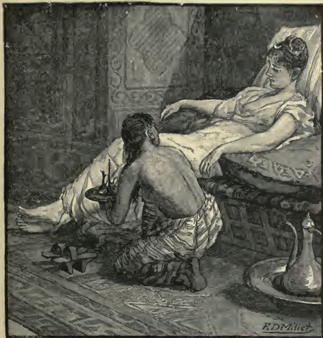
"DRESSING THE BRIDE." Page 58.